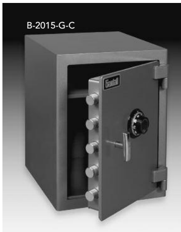
Five massive 1/4" bolts in boltwork